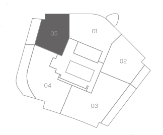
floor 30 $\uparrow$ N